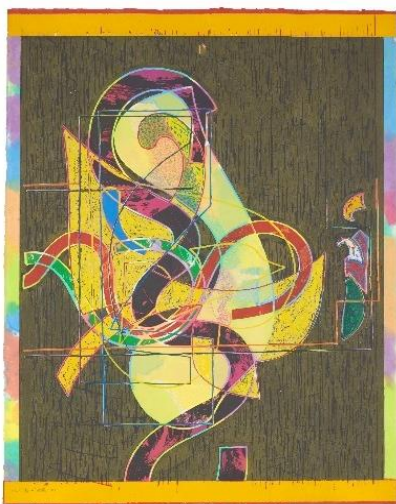
FRANK STELLA (B. 1936) Pergusa Three, State I, from Circuits